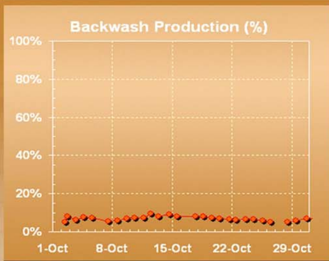
Operating Data from October 2007

below detection limits (<1.1 mg/l). Effluent Turbidity, measured as NTU, was consistently below 1.5 NTU, with numerous daily grab samples well below 1 NTU. (See data for Oct '07).