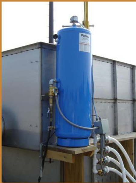
Air Scour Air Reservoir Added Spring 2007